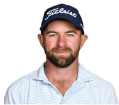
Cameron Young PGA TOUR