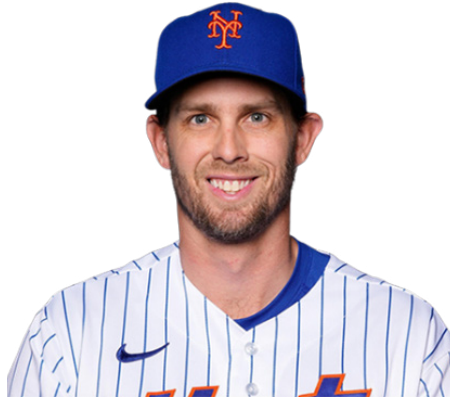
Jeff McNeil New York Mets